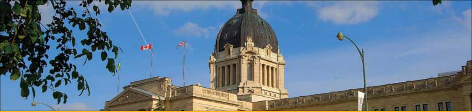
Photo Credit: Tourism Saskatchewan, Hans-Gerhard Pfaff, Saskatchewan Legislative Building