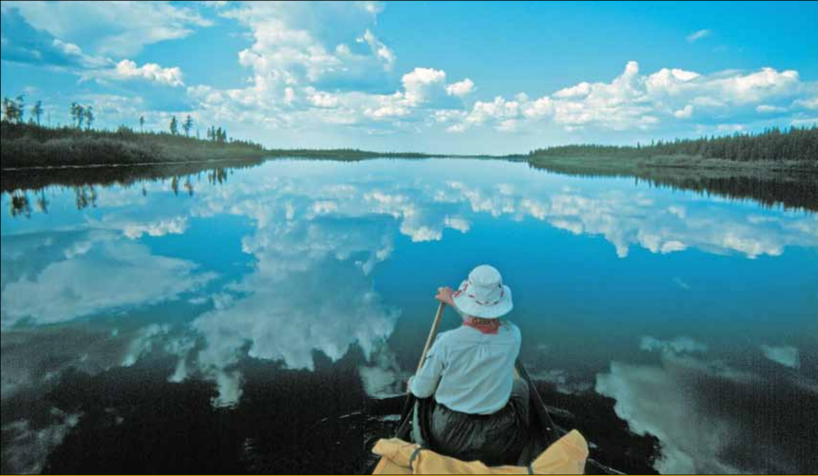
Canoeing, MacFarlane River