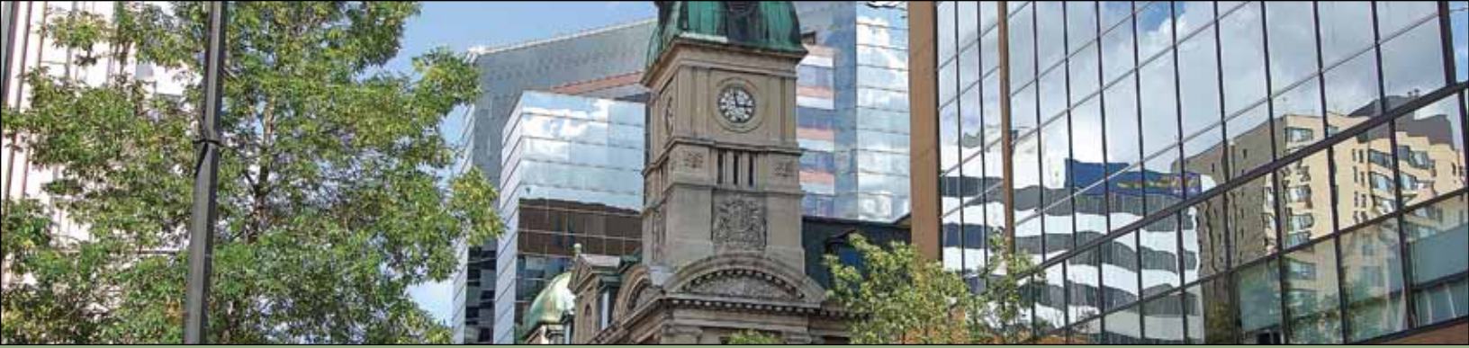
Photo Credit: Tourism Saskatchewan, Hans-Gerhard Pfaff, Downtown Regina